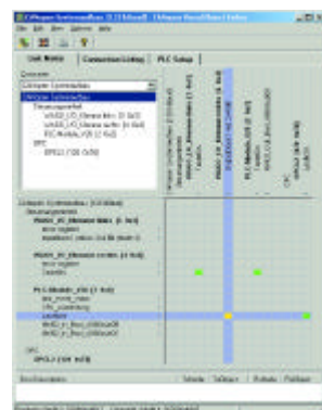
Fig. 3: Module to automatically link input/output data. The Visual Object Linker of CANopen ConfigurationStudio

include a freely configurable, standardized boot-up procedure to control network boot-up and to manage all devices on the system, a Configuration Manager to maintain configuration data for all devices on a system, and an interface to provide simple access to the process data of the application (the loaded program) via the object directory. In the past, a device manufacturer had to write his own programs for all of these functions and address many more